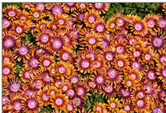
Fire Spinner Ice Plant in bloom

Fire Spinner Ice Plant is recommended for the following landscape applications;