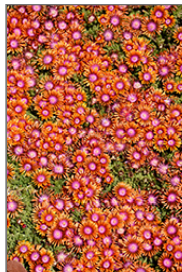
Fire Spinner Ice Plant flowers