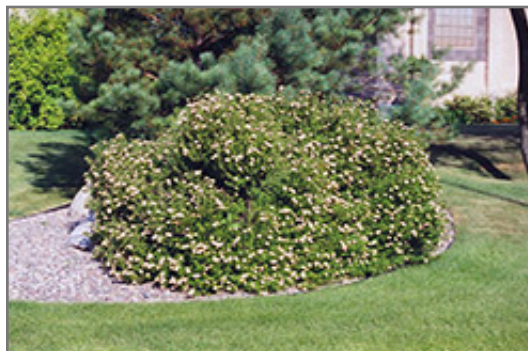
Pink Beauty Potentilla in bloom