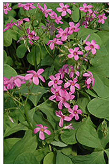
Pink Wood Sorrel flowers