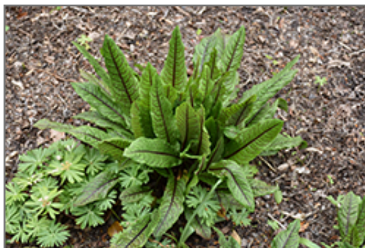
Ornamental Sorrel

Ornamental Sorrel is recommended for the following landscape applications;