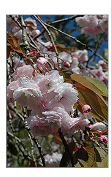
White Flowering Cherry flowers

White Flowering Cherry is covered in stunning clusters of fragrant shell pink flowers along the branches in early spring, which emerge from distinctive ruby-red flower buds before the leaves. It has attractive deep purple-tipped dark green foliage which emerges burgundy in spring. The serrated pointy leaves are highly ornamental and turn an outstanding orange in the fall. The smooth dark red bark adds an interesting dimension to the landscape.