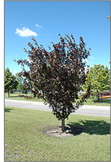
Thunderchild Flowering Crab

This tree should only be grown in full sunlight. It prefers to grow in average to moist conditions, and shouldn't be allowed to dry out. It is not particular as to soil type or pH. It is highly tolerant of urban pollution and will even thrive in inner city environments. This particular variety is an interspecific hybrid.