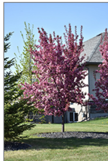
Thunderchild Flowering Crab in bloom

This tree will require occasional maintenance and upkeep, and is best pruned in late winter once the threat of extreme cold has passed. It has no significant negative characteristics.