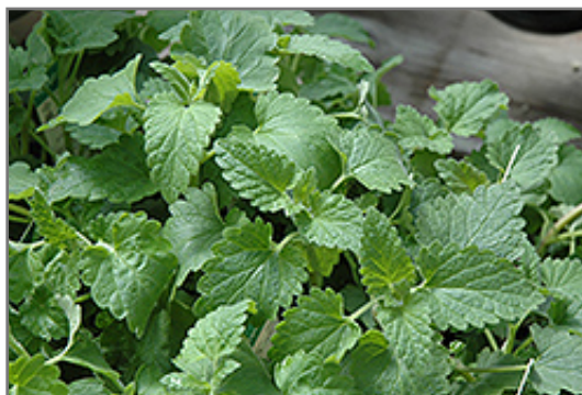
Catnip foliage