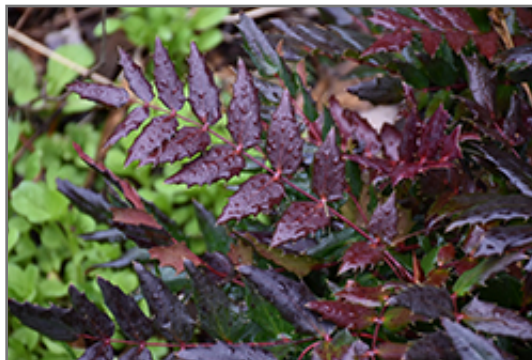
Oregon Grape Holly foliage

This shrub does best in partial shade to shade. It does best in average to evenly moist conditions, but will not tolerate standing water. It is not particular as to soil pH, but grows best in rich soils. It is somewhat tolerant of urban pollution, and will benefit from being planted in a relatively sheltered location. Consider applying a thick mulch around the root zone in winter to protect it in exposed locations or colder microclimates. This species is native to parts of North America.