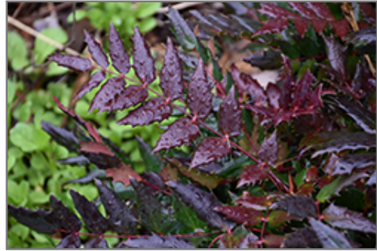
Oregon Grape Holly foliage

This shrub does best in partial shade to shade. It does best in average to evenly moist conditions, but will not tolerate standing water. It is not particular as to soil pH, but grows best in rich soils. It is somewhat tolerant of urban pollution, and will benefit from being planted in a relatively sheltered location. Consider applying a thick mulch around the root zone in winter to protect it in exposed locations or colder microclimates. This species is native to parts of North America.