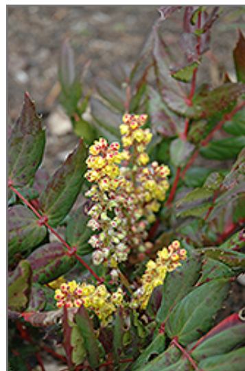
Oregon Grape Holly flowers

Oregon Grape Holly is a multi-stemmed evergreen shrub with a ground-hugging habit of growth. Its average texture blends into the landscape, but can be balanced by one or two finer or coarser trees or shrubs for an effective composition.