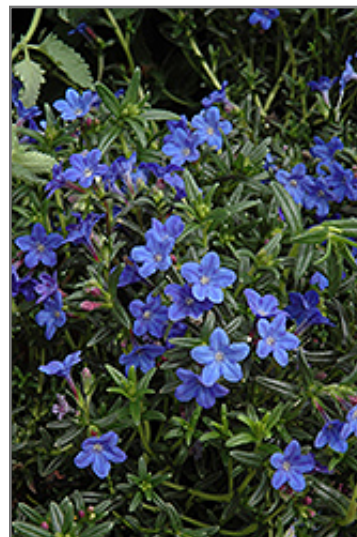
Grace Ward Lithodora flowers