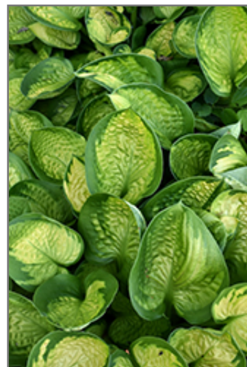
Rainforest Sunrise Hosta foliage

Rainforest Sunrise Hosta is recommended for the following landscape applications;