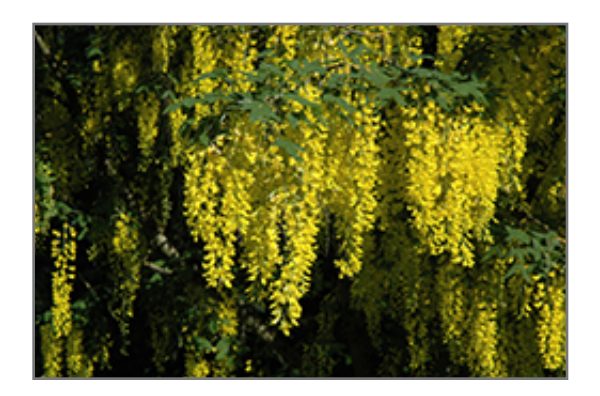
Vossii Laburnum flowers

Vossii Laburnum is recommended for the following landscape applications;