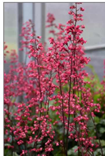
Paris Coral Bells flowers