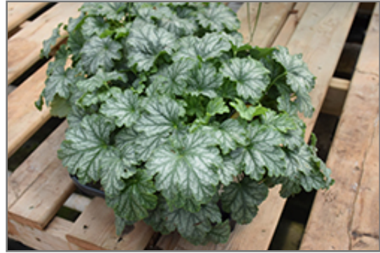
Paris Coral Bells foliage

Paris Coral Bells will grow to be about 8 inches tall at maturity extending to 14 inches tall with the flowers, with a spread of 14 inches. When grown in masses or used as a bedding plant, individual plants should be spaced approximately 12 inches apart. Its foliage tends to remain low and dense right to the ground. It grows at a medium rate, and under ideal conditions can be expected to live for approximately 10 years. As an evergreen perennial, this plant will typically keep its form and foliage year-round.