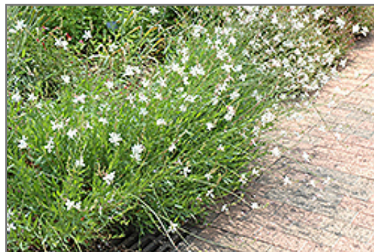
Whirling Butterflies Gaura in bloom