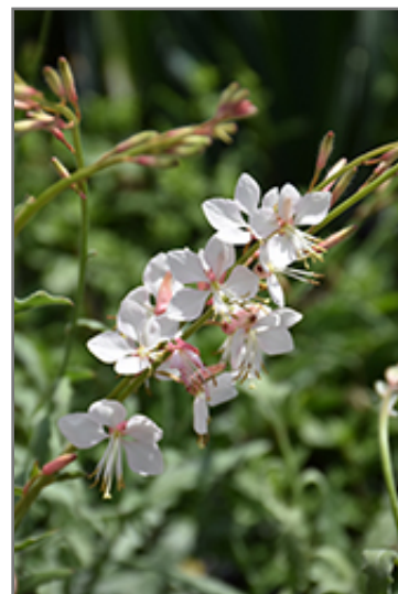
Whirling Butterflies Gaura flowers

This is a relatively low maintenance plant, and is best cleaned up in early spring before it resumes active growth for the season. It is a good choice for attracting butterflies to your yard, but is not particularly attractive to deer who tend to leave it alone in favor of tastier treats. It has no significant negative characteristics.