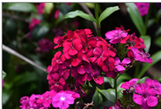
Amazon Neon Cherry Pinks flowers

Amazon Neon Cherry Pinks is a fine choice for the garden, but it is also a good selection for planting in outdoor pots and containers. Because of its height, it is often used as a 'thriller' in the 'spiller-thriller-filler' container combination; plant it near the center of the pot, surrounded by smaller plants and those that spill over the edges. Note that when growing plants in outdoor containers and baskets, they may require more frequent waterings than they would in the yard or garden.