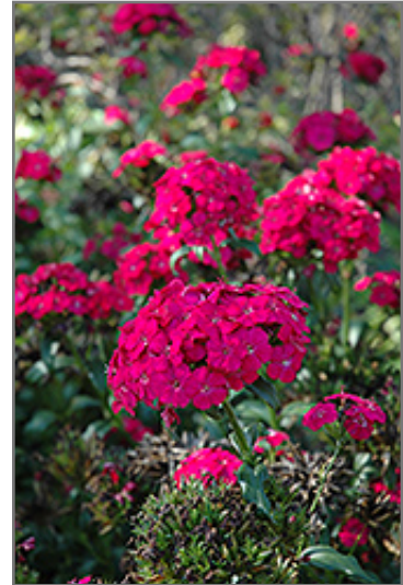
Amazon Neon Cherry Pinks flowers

This is a relatively low maintenance plant, and is best cleaned up in early spring before it resumes active growth for the season. It is a good choice for attracting bees and butterflies to your yard, but is not particularly attractive to deer who tend to leave it alone in favor of tastier treats. It has no significant negative characteristics.