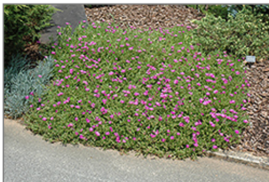
Purple Ice Plant in bloom

Purple Ice Plant will grow to be only 2 inches tall at maturity extending to 3 inches tall with the flowers, with a spread of 24 inches. Its foliage tends to remain low and dense right to the ground. It grows at a fast rate, and under ideal conditions can be expected to live for approximately 5 years. As an evergreen perennial, this plant will typically keep its form and foliage year-round.