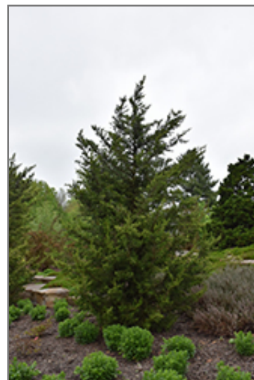
Fairview Juniper