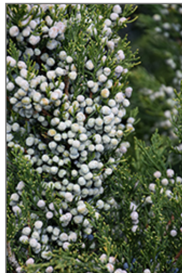
Fairview Juniper fruit