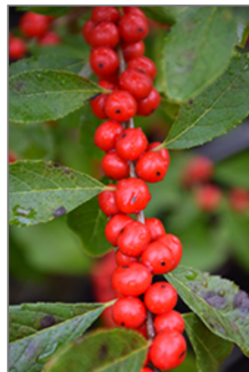
Red Sprite Winterberry fruit

Red Sprite Winterberry is recommended for the following landscape applications;