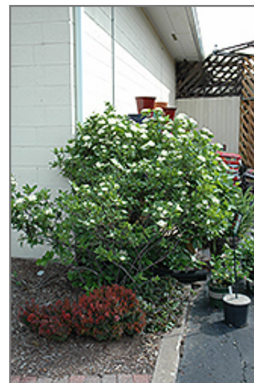
Winterthur Viburnum in bloom