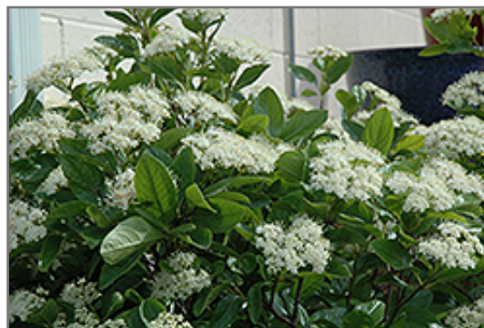
Winterthur Viburnum flowers

This is a relatively low maintenance shrub, and should only be pruned after flowering to avoid removing any of the current season's flowers. It is a good choice for attracting birds to your yard, but is not particularly attractive to deer who tend to leave it alone in favor of tastier treats. It has no significant negative characteristics.