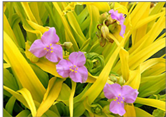
Sunshine Charm Spiderwort flowers