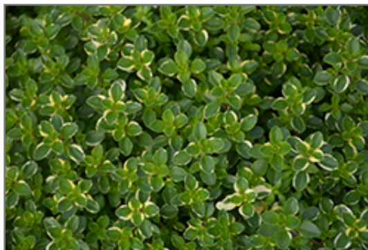
Variegated Broadleaf Thyme foliage