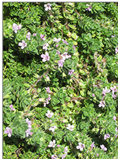
Pink Chintz Creeping Thyme flowers