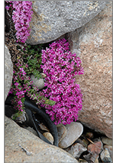
Pink Chintz Creeping Thyme in bloom

This plant should only be grown in full sunlight. It prefers to grow in average to dry locations, and dislikes excessive moisture. It is considered to be drought-tolerant, and thus makes an ideal choice for a low-water garden or xeriscape application. It is not particular as to soil type or pH. It is highly tolerant of urban pollution and will even thrive in inner city environments. Consider covering it with a thick layer of mulch in winter to protect it in exposed locations or colder microclimates. This is a selected variety of a species not originally from North America. It can be propagated by division; however, as a cultivated variety, be aware that it may be subject to certain restrictions or prohibitions on propagation.