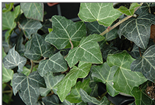
Baltic Ivy foliage