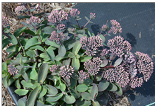
Chocolate Drop Stonecrop flower buds

Chocolate Drop Stonecrop is a fine choice for the garden, but it is also a good selection for planting in outdoor pots and containers. It is often used as a 'filler' in the 'spiller-thriller-filler' container combination, providing a mass of flowers and foliage against which the larger thriller plants stand out. Note that when growing plants in outdoor containers and baskets, they may require more frequent waterings than they would in the yard or garden.