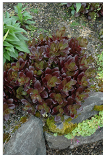
Chocolate Drop Stonecrop

Chocolate Drop Stonecrop is a dense herbaceous perennial with an upright spreading habit of growth. Its relatively coarse texture can be used to stand it apart from other garden plants with finer foliage.