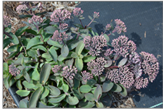
Chocolate Drop Stonecrop flower buds

Chocolate Drop Stonecrop is a fine choice for the garden, but it is also a good selection for planting in outdoor pots and containers. It is often used as a 'filler' in the 'spiller-thriller-filler' container combination, providing a mass of flowers and foliage against which the larger thriller plants stand out. Note that when growing plants in outdoor containers and baskets, they may require more frequent waterings than they would in the yard or garden.