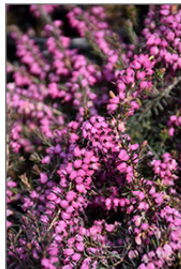
Springwood Pink Heath flowers

Springwood Pink Heath is recommended for the following landscape applications;