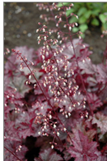
Amethyst Mist Coral Bells flowers