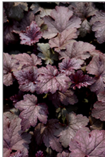
Amethyst Mist Coral Bells foliage

Amethyst Mist Coral Bells is recommended for the following landscape applications;