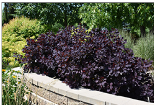
Royal Purple Smokebush