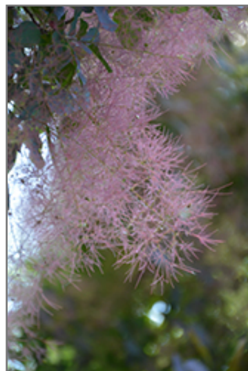
Royal Purple Smokebush flowers

This shrub should only be grown in full sunlight. It is very adaptable to both dry and moist locations, and should do just fine under average home landscape conditions. It is not particular as to soil type or pH. It is highly tolerant of urban pollution and will even thrive in inner city environments, and will benefit from being planted in a relatively sheltered location. This is a selected variety of a species not originally from North America.