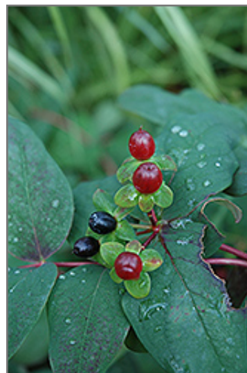
Albury Purple St. John's Wort fruit

Albury Purple St. John's Wort makes a fine choice for the outdoor landscape, but it is also well-suited for use in outdoor pots and containers. With its upright habit of growth, it is best suited for use as a 'thriller' in the 'spiller-thriller-filler' container combination; plant it near the center of the pot, surrounded by smaller plants and those that spill over the edges. It is even sizeable enough that it can be grown alone in a suitable container. Note that when grown in a container, it may not perform exactly as indicated on the tag - this is to be expected. Also note that when growing plants in outdoor containers and baskets, they may require more frequent waterings than they would in the yard or garden.