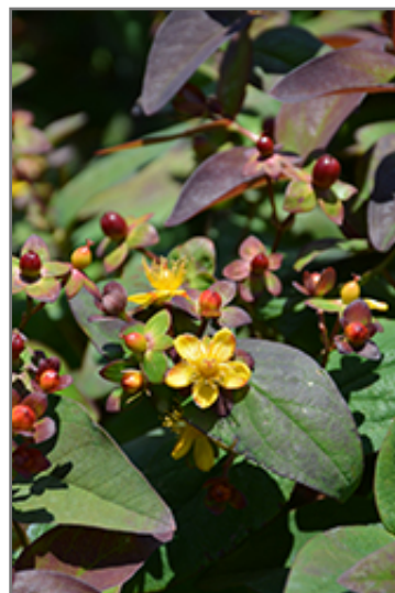
Albury Purple St. John's Wort flowers