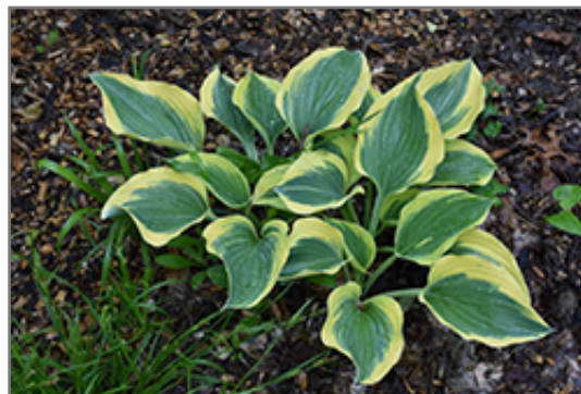
Liberty Hosta