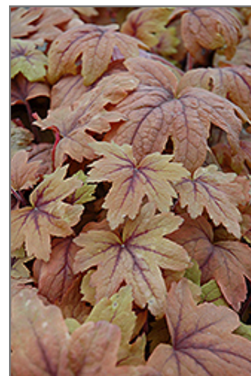
Sweet Tea Foamy Bells foliage