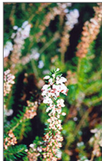
Scotch Heather flowers