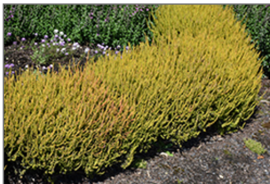
Firefly Heather

This shrub should only be grown in full sunlight. It requires an evenly moist well-drained soil for optimal growth, but will die in standing water. It is very fussy about its soil conditions and must have sandy, acidic soils to ensure success, and is subject to chlorosis (yellowing) of the foliage in alkaline soils. It is somewhat tolerant of urban pollution, and will benefit from being planted in a relatively sheltered location. Consider applying a thick mulch around the root zone in winter to protect it in exposed locations or colder microclimates. This is a selected variety of a species not originally from North America.