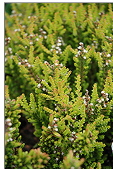
Firefly Heather foliage