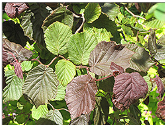
Red Majestic Corkscrew Hazelnut foliage