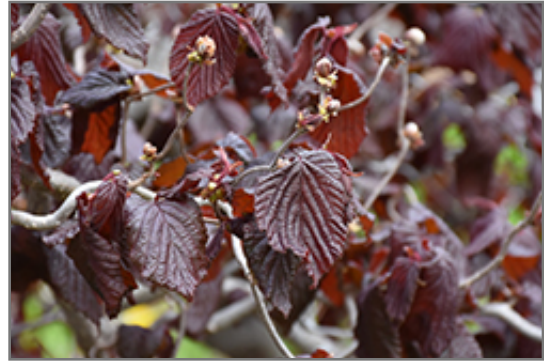
Red Majestic Corkscrew Hazelnut foliage

This shrub does best in full sun to partial shade. It is very adaptable to both dry and moist locations, and should do just fine under average home landscape conditions. It is not particular as to soil type or pH. It is highly tolerant of urban pollution and will even thrive in inner city environments. This is a selected variety of a species not originally from North America.