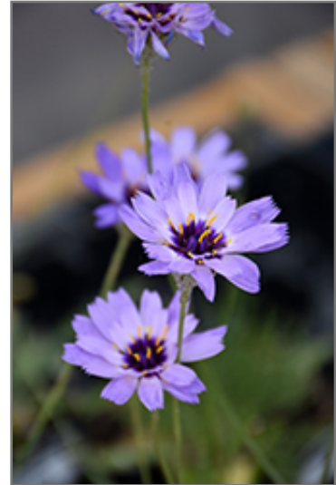
Cupid's Dart flowers

Cupid's Dart is recommended for the following landscape applications;