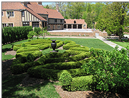
Compact Korean Boxwood

Compact Korean Boxwood will grow to be about 12 inches tall at maturity, with a spread of 12 inches. It tends to fill out right to the ground and therefore doesn't necessarily require facer plants in front. It grows at a slow rate, and under ideal conditions can be expected to live for approximately 30 years.