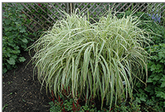
Dixieland Maiden Grass flowers