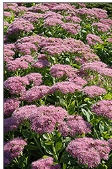
Brilliant Stonecrop flowers

Brilliant Stonecrop is recommended for the following landscape applications;