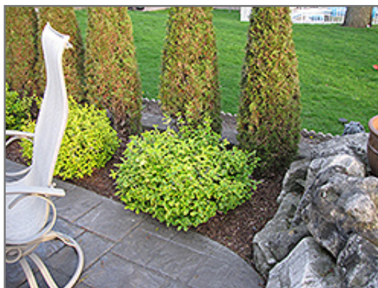
Country Gold Wintercreeper