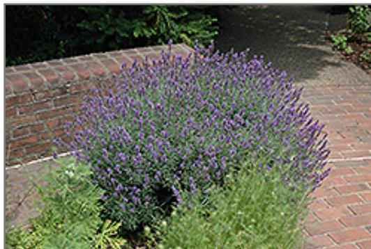
English Lavender in bloom

English Lavender is recommended for the following landscape applications;