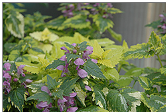
Anne Greenaway Spotted Dead Nettle flowers