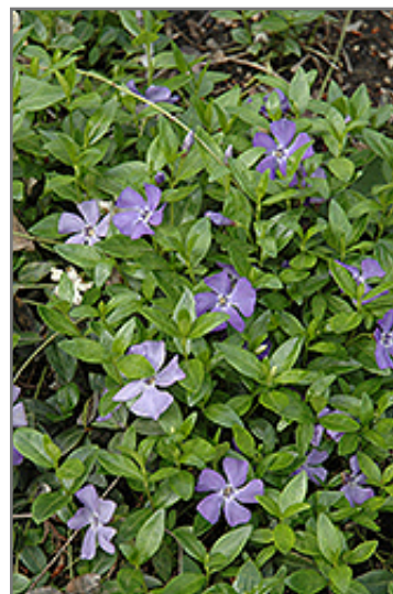
Common Periwinkle in bloom

Common Periwinkle is recommended for the following landscape applications;