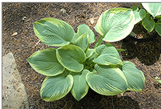
Robert Frost Hosta