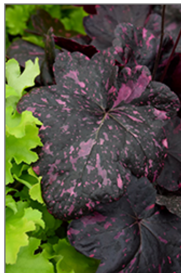
Midnight Rose Coral Bells foliage

Midnight Rose Coral Bells is recommended for the following landscape applications;