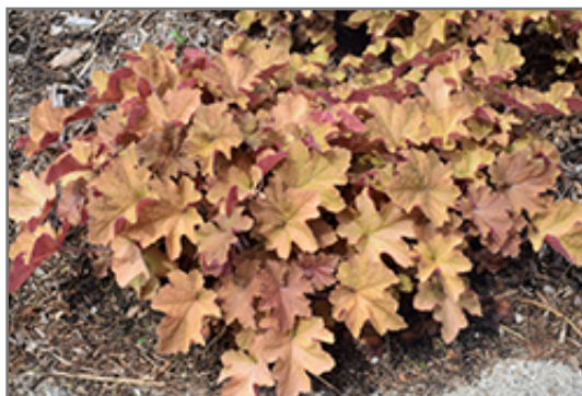
Caramel Coral Bells

Caramel Coral Bells will grow to be about 10 inches tall at maturity extending to 18 inches tall with the flowers, with a spread of 18 inches. When grown in masses or used as a bedding plant, individual plants should be spaced approximately 15 inches apart. Its foliage tends to remain low and dense right to the ground. It grows at a medium rate, and under ideal conditions can be expected to live for approximately 10 years. As an evergreen perennial, this plant will typically keep its form and foliage year-round.