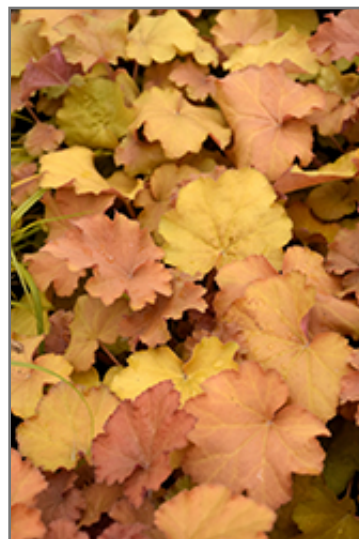
Caramel Coral Bells foliage

Caramel Coral Bells is recommended for the following landscape applications;