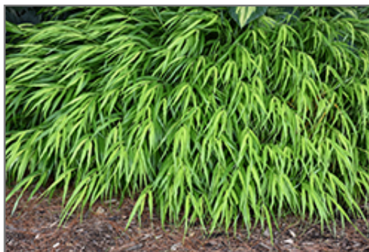
All Gold Hakone Grass foliage