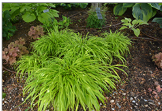
All Gold Hakone Grass