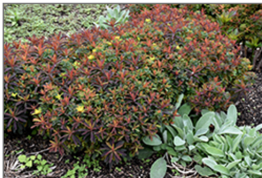
Bonfire Cushion Spurge