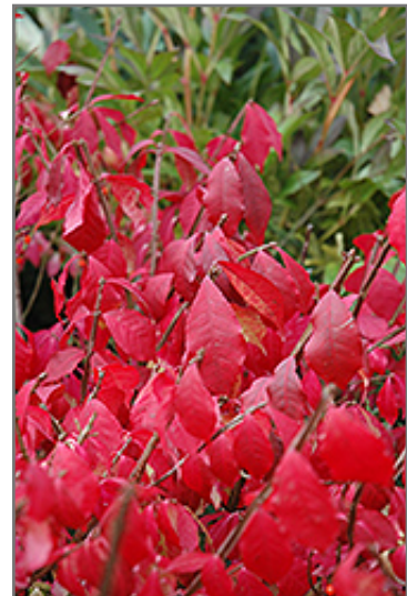
Burning Bush (tree form) in fall