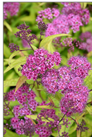
Flaming Mound Spirea flowers

Flaming Mound Spirea is recommended for the following landscape applications;