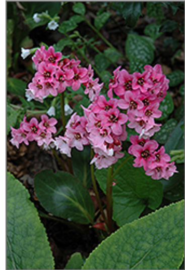
Pink Dragonfly Bergenia flowers