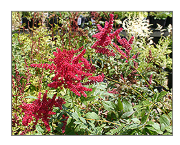
Glow Astilbe flowers