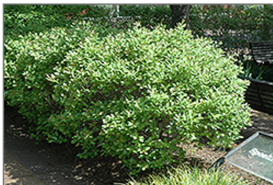
Jim Dandy Winterberry